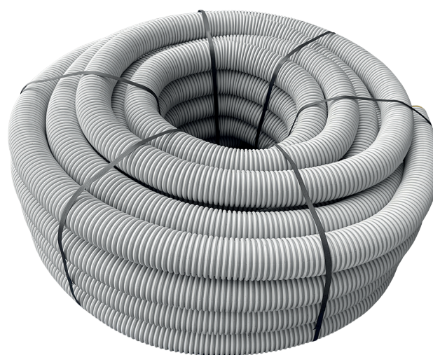
QV75P-HP Quiet-Vent 75mm x 50 Metre Antibacterial Radial Pipe